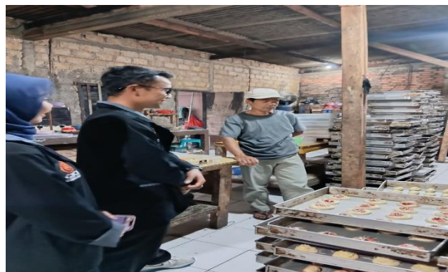
Figure 1. Documentation of Community Service Activities